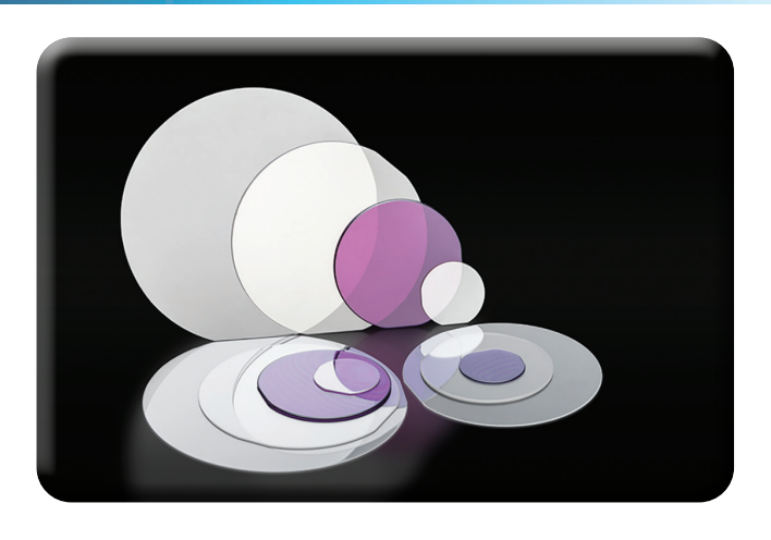
Garnets wafers of different compositions (SGGG, GGG, NGG) and different diameters (from 1" to 4")

We have a large industrial capacity available and we can provide unique pieces as well as thousands of wafers.